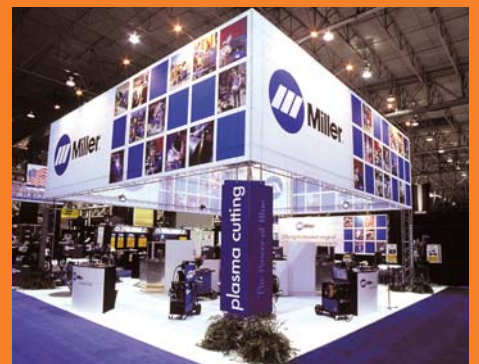
Massive overhead graphics