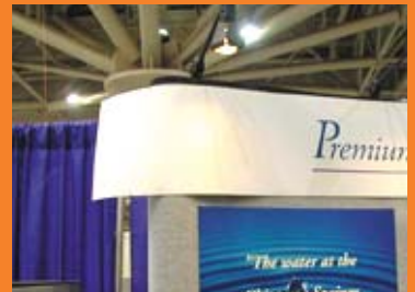
Poor finishing can keep panels from staying in place.