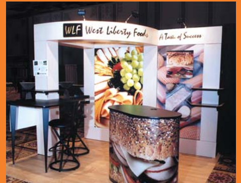
Accurate colors are great for food images

Inkjet – Inkjet prints have very saturated colors and are great for creating graphics with solid fills of color, line art, and photo images. Inkjet is a quality print and can be a lower-cost alternative to Lambda. Perfect for headers, text panels, murals and backlit graphics.