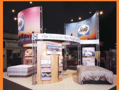
Bridge and stand-off graphics

Fabric – Inkjet prints can be permanently transferred to fabric using high heat and pressure giving you full color, photo quality graphics that are durable, very lightweight and pack compactly. Fabric graphics are great for banners, hanging signs, and canopies.