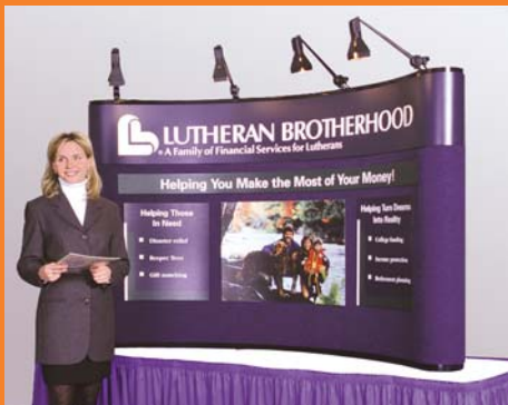
Detachable text and image panels

Inkjet – Inkjet prints have very saturated colors and are great for creating graphics with solid fills of color, line art, and photo images. Inkjet is a quality print and can be a lower-cost alternative to Lambda. Perfect for headers, text panels, murals and backlit graphics.