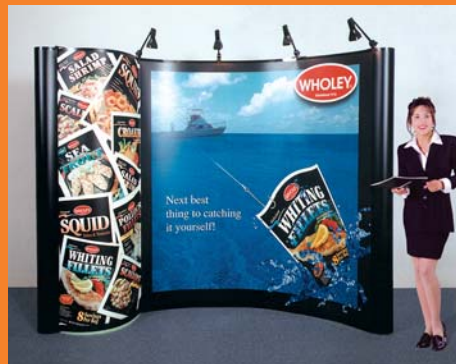
Backlit graphics and murals