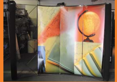
Improper fit creates waves and gaps – and an unprofessional look.

Skyline IES: We produce your graphic to fit your show schedule – and your budget. For heavy use, a thicker, more durable laminate will keep your graphic looking new. For lighter use, you can get by with a less expensive graphic.