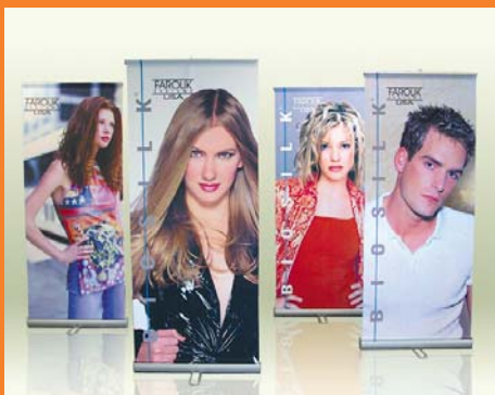
Banner stand graphics

Fabric – Inkjet prints can be permanently transferred to fabric using high heat and pressure giving you full color, photo quality graphics that are durable, very lightweight and pack compactly. Fabric graphics are great for banners, hanging signs, and canopies.