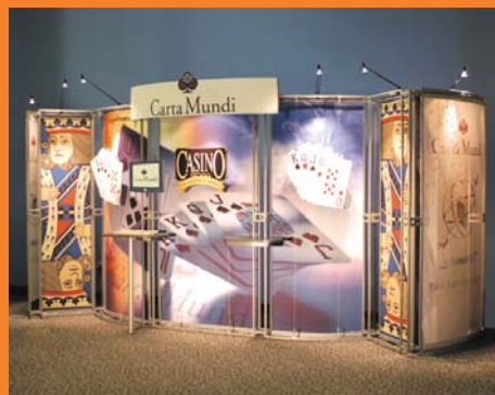
Backwall exhibit panels