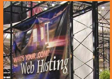
Without proper fit and attachments, graphics sag and lose readability.