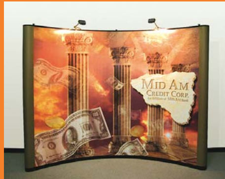
Rich colors for vibrant murals